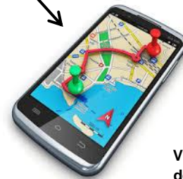
Video clip download

RFID Or Driver Push Button Or Door Switch Or Motion Detect