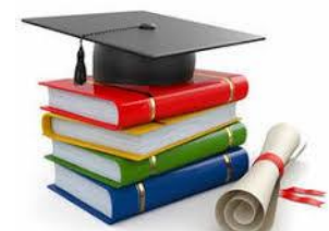
School Management System