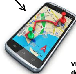
Video clip download