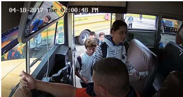
Snap Shot Camera