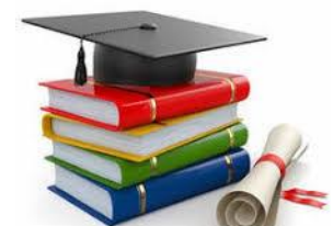
School Management System

RFID Or Driver Push Button Or Door Switch Or Motion Detect