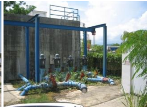
Water & Waste Water